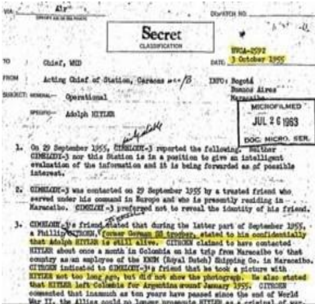
Figure 4-4 above: State Department document related to Figure 4-3.